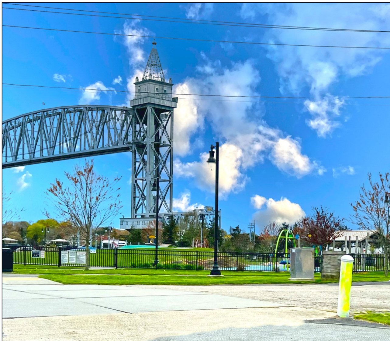
View from Unit