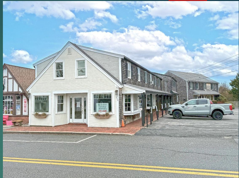
450 Main Street