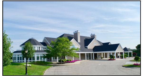
The Golf Club of Cape Cod Clubhouse