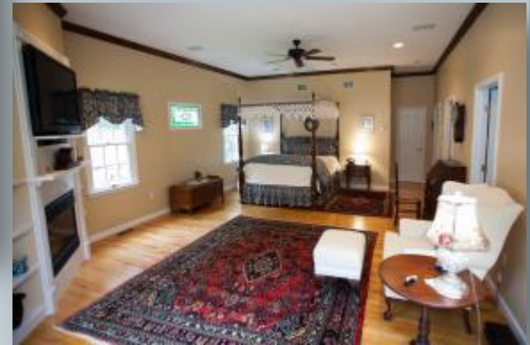
Property Interior Views