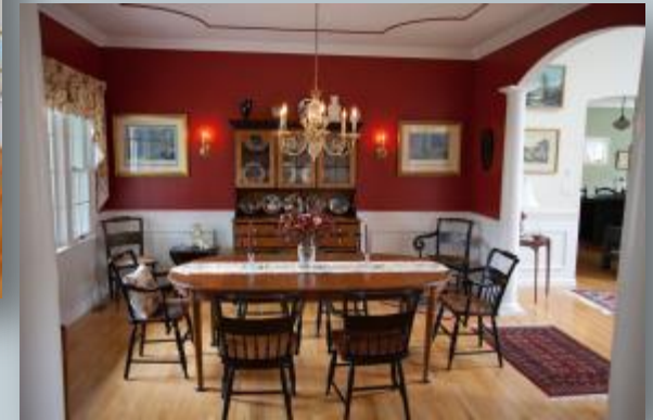
Property Interior Views