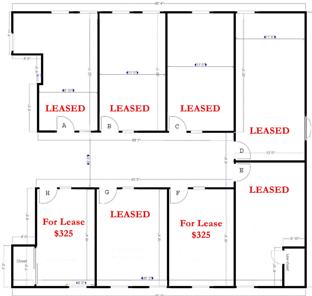
Deer Crossing Suite A20 (A-H)