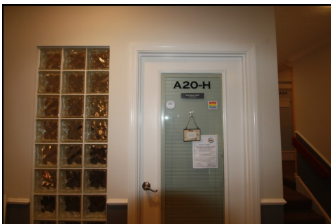
VIEW OF ENTRANCE