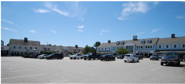
View from Falmouth Road, Rte 28